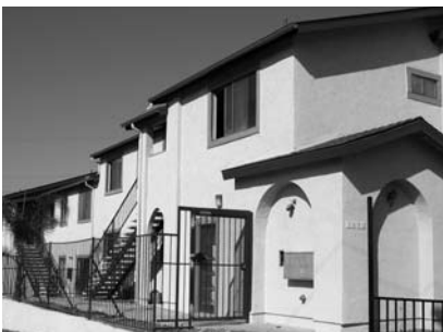
35th Street Apartments

Move in before June and the first six month's rent is only $450 a month!